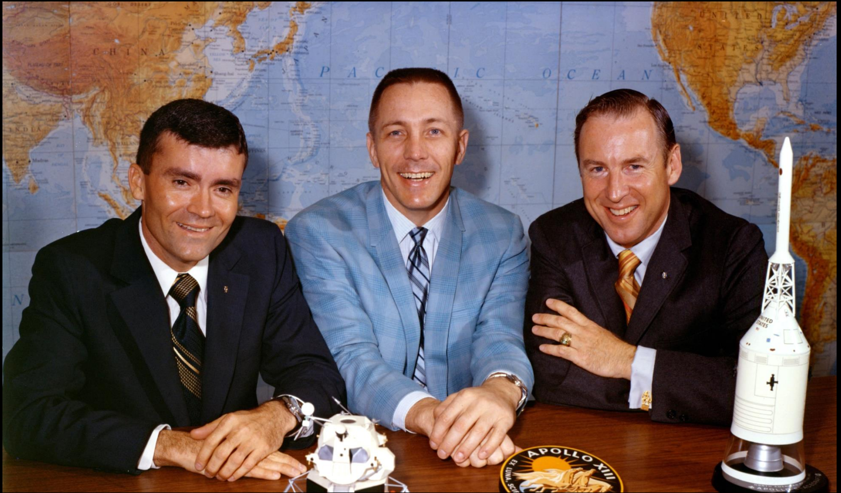
Fred Haise Lunar Module Pilot